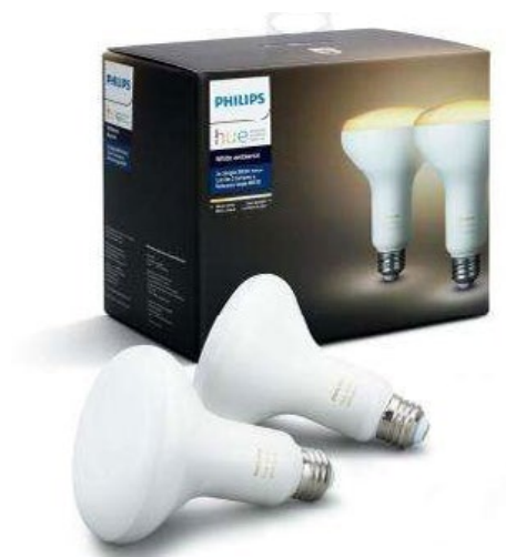
Smart Light Bulbs

LED bulbs that can be controlled with Apple or Androids apps.