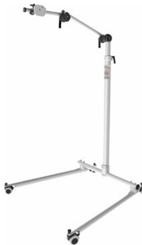
Tablet & SGD Floor Mount

Upright stand to hold tablet or speech generating devices.