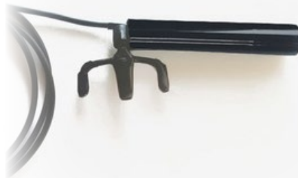
Switch Adapted Laser Pointer

Simple partner-assisted communication tool used by pointing or with laser pointer.