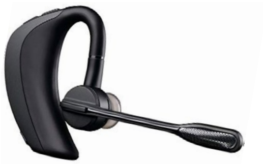
Plantronics Bluetooth Headset

Hands-free voice activated cell phone accessory.