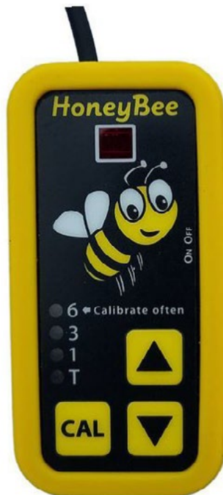
Honey Bee Switch

Switch can be activated touch-free at 3 and 6 inch distances.