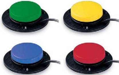
Spec/Jelly Bean Switch

Adaptive switches provide an interface for a user with limited physical ability to access a device screen or button; such as an iPad, speech generating device, or alert system. Switches may plug into a device or connect via bluetooth, and require minimal pressure or even just a slight movement to activate.