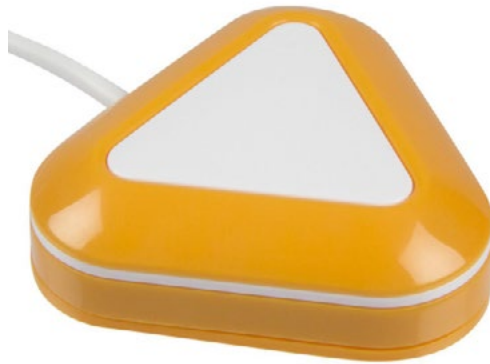
Candy Corn Switch

Highly sensitive touch-free switch that can be activated with just a wave.